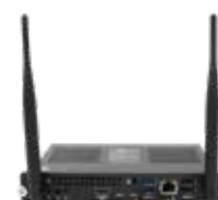
SMART OPS PC module The power of Windows® 11 Pro – no laptop needed