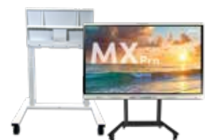
SMART mobile stands Add flexibility and mobility