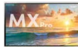
SMART Board® MX Pro series Where productivity and collaboration meet