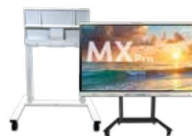
SMART mobile stands Add flexibility and mobility