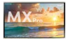
SMART Board® MX Pro series Where productivity and collaboration meet